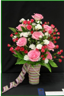
Above: "Preppy" A design incorporating neckwear Blue Ribbon: Diane Swartwout