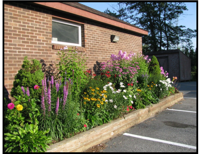
Indian Lake Post Office garden

ILGC's 2011 season opened in March with their traditional end-of-winter(!?) potluck. The group was small because "snow birds" had not yet returned to the Adirondacks. In April members will view a video program, "Foolproof Flower Gardens," produced by Better Homes & Gardens and rented from NGC's Member Services. The club's civic beautification projects will continue when the snow melts and garden work can begin. Last fall members expanded the Post Office garden to