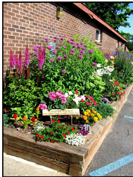
Indian Lake post office garden.

Mother Nature cooperated in providing beautiful weather for both visits.