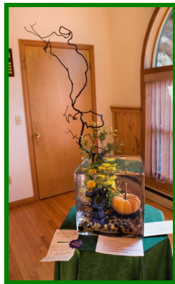
Mickey Snye "underwater design"